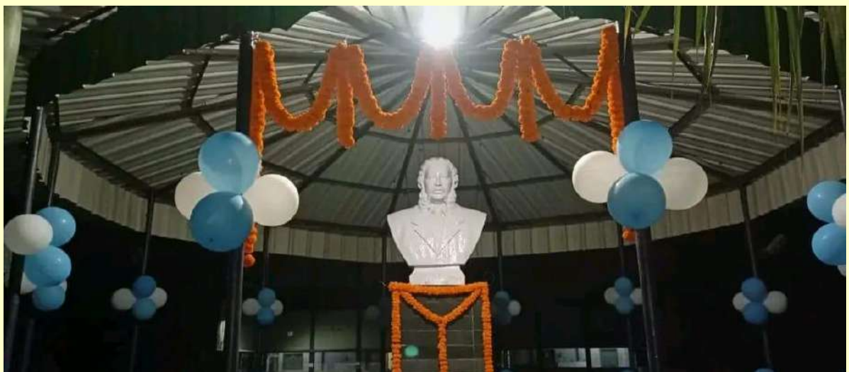
Decoration of Michael Statue