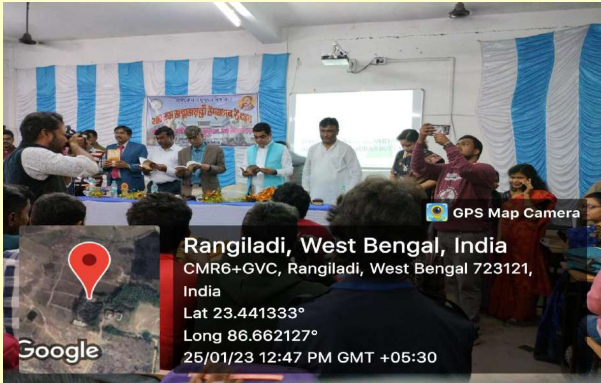
“Pathachakra – 1” (ISBN Book) publishing programme on the stage