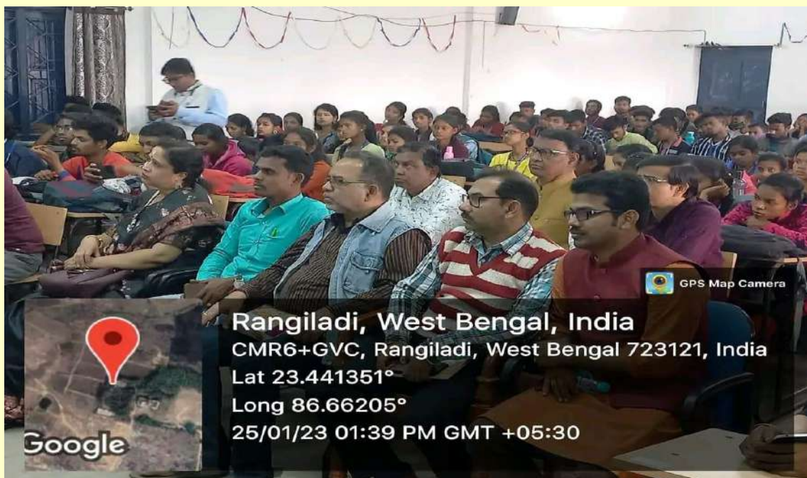
Audience of Seminar Hall