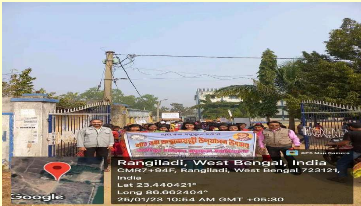
Road procession by the students