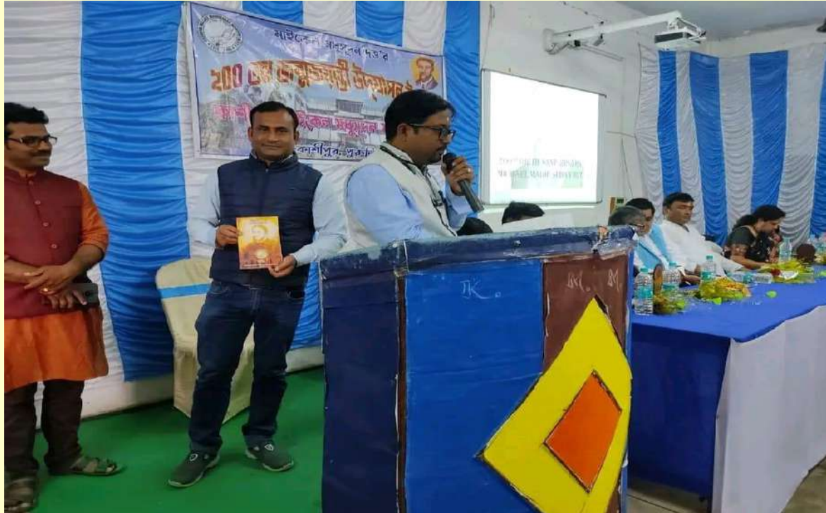
“Pathachakra – 1” (ISBN Book) publishing programme on the stage