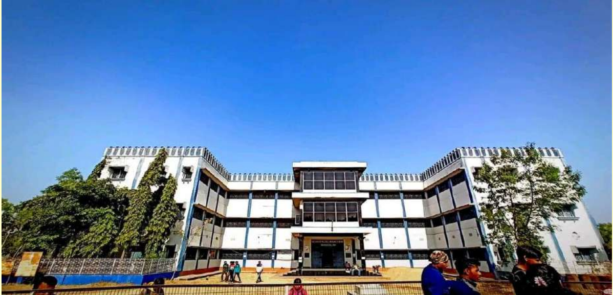
Kashipur College Campus