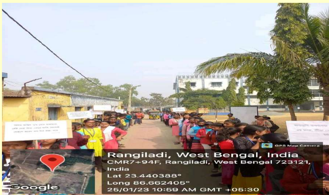
Procession towards Kashipur Hattola