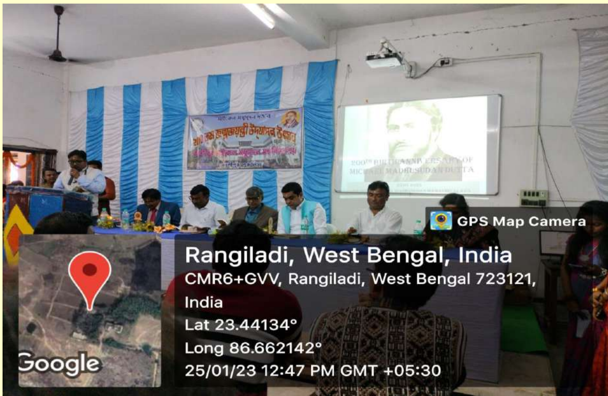
Honourable Guests on the stage